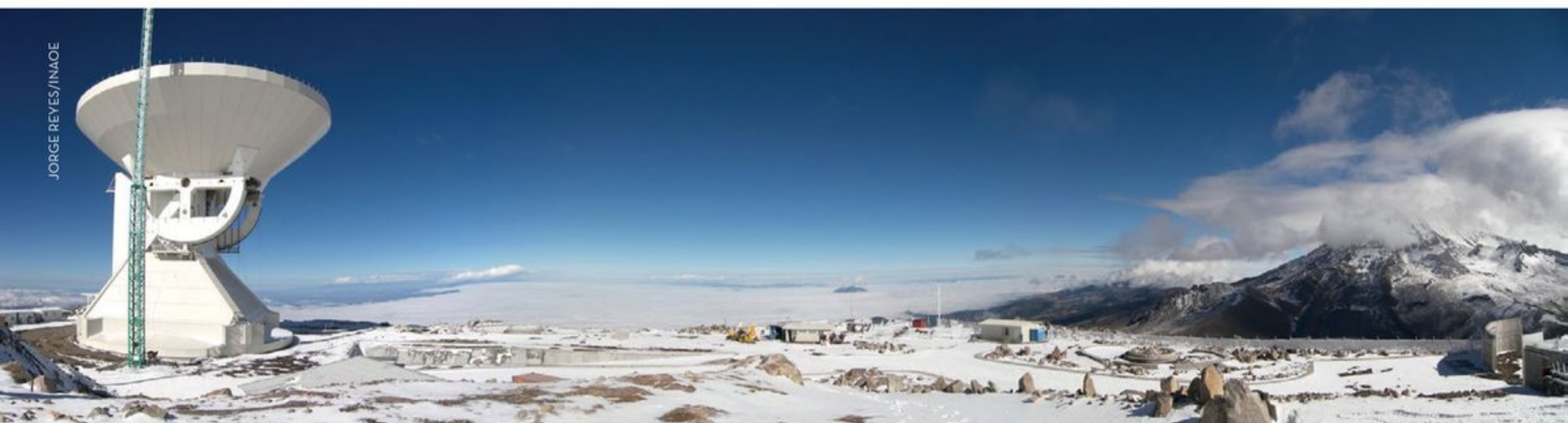
The LMT stands on a mountaintop 150 miles east of Mexico City.

tutions in 12 countries. “More would have been submitted but we discouraged them for our maiden observations,” says Schloerb. A second round of studies from different proposals was undertaken in December. “Once we establish and report on the LMT’s level of precision, which is excellent, I think people are going to beat a path to our door to get time on it for their own projects,” notes Schloerb.